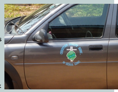
CHASL logo on the right car

making sure the car was registered and insured properly. We even applied the CHASL logo to our vehicle and the other CHASL vehicle to make passage through the security checks easier. I must tell you a small funny on myself. I had cut these vinyl stickers on my cricut at home in the US. When I cut them, for some odd reason I cut an odd number. Well since all vehicles have two front doors, I wasn't sure what I was going to do with the extra one. When I went to apply them, I cleaned the doors of the Chasl land cruiser and our land rover. Then I applied the stickers to the Chasl land cruiser. I was just about to apply them to our land rover when I was called into the office. I came back out and applied the decal to the side of the black vehicle. Problem was, our vehicle is dark grey. I had just applied the stickers, all I2 square inches of them, to someone else's vehicle.! Then I looked over and saw our vehicle sitting next to the one I had just applied the stickers