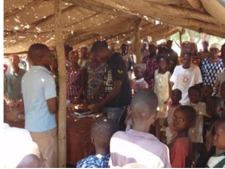
The church meets in the lean to for 8 weeks.