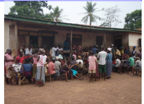
The village hands over the church land and the school