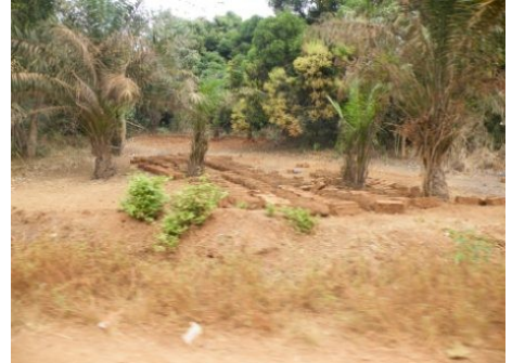
Making blocks from mud.