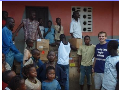
Bringing textbooks to the school