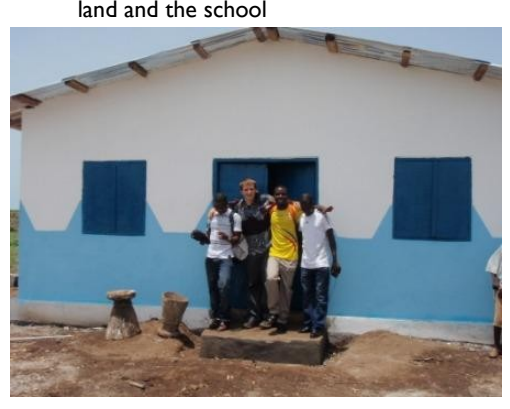
Men with a vision and the grand opening!

There is so much that has happened since our last newsletter, that I am going to do a monthly letter for the next three months. I don't want you to miss any of the miraculous details.. God has been so good to Kamakwie and the Bombali district.