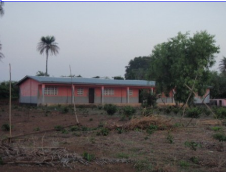
Kakamba Junior Secondary School