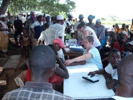
This clinic planted the church.

Weekly church services. They started with just a handful of youth, then a few adults from the town started attending. When we went to see the progress of the church, I was afraid that the Muslim leaders might complain about the adults who were attending. When they had first approached us about building a church they had said that “we won’t cross the carpet (convert) but we will allow the picken den (children) to make up their own minds.” But after some adults started coming they just said “its better to have people wanting to go to church than not wanting to go to mosque.” And then the leaders called us to a meeting with the Kamakwie District secretary and gave the junior secondary school that had been built by the village community, to the Wesleyan church. They said they were afraid that if it became Muslim the children might not be able to attend the church. On May 22, 2011 just 6 weeks after the ground breaking, the youth carried benches from the school to the new building and we held Sunday school and church service in the new building. There were over 160 in attendance. The young men from the youth groups (primarily the same guys who started the youth scholarship program) are tending to the new converts and preaching at the service. Please pray for this new church and for help with the schools. I have put some pictures of the building progress below.