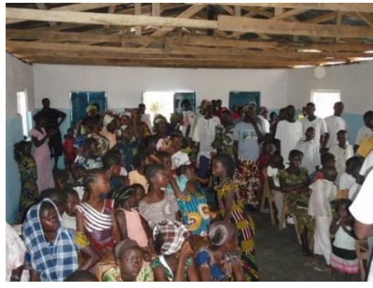
A packed church!