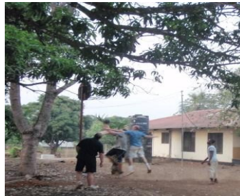
Who said white men can't jump?