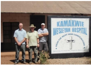
"City Slickers" in Africa ! Just kidding!